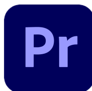
Adobe Premiere Pro

Adobe Premiere Pro is a professional video editing software used in video post-production for non-linear editing and efficient video production.