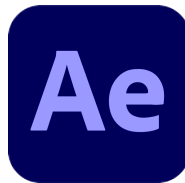
Adobe After Effects

Adobe After Effects is a leading VFX software used in video post-production for creating advanced visual effects, motion graphics, and compositing.